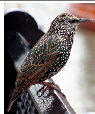
Common Starling In London

Throughout much of the dark ages, the poorest citizens dreaded the height of summer as it brought the "hungry gap", when those who could not afford to store grain, or buy food, often went hungry. They existed on a meagre diet, usually including rye bread, which was invariably mouldy. The mould that grew on it was ergot, which gave the peasants a dose of lysergic acid - otherwise known as LSD. At best it would render them delirious; at worst, it could kill. They also scavenged in the hedgerows for poppies and hemp, which were ground up and baked in a cake. The peasants knew what this "crazy bread" did to them but they had little choice. The result, as contemporary historian Piers Plowman recorded, was a kind of mass hysteria expressed in over excited summer festivals, fuelled by the unintentional drug taking and light headedness of hunger. From Nikki, the History of Britain Pocket Companion